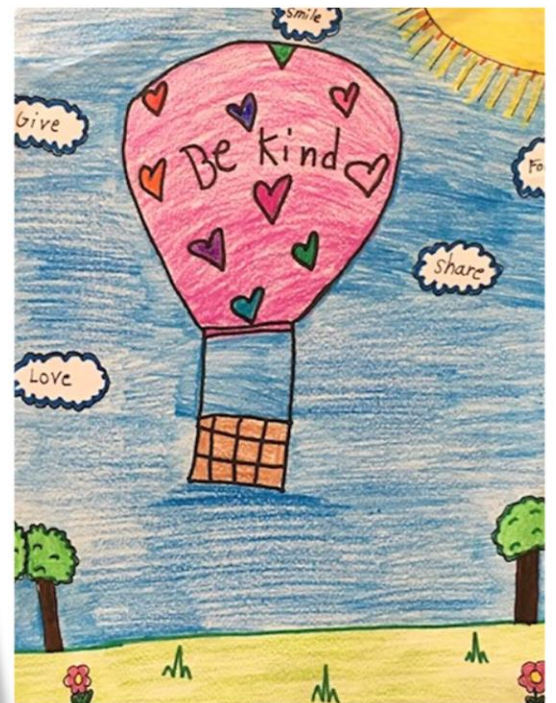
Submitted by Bella Norton