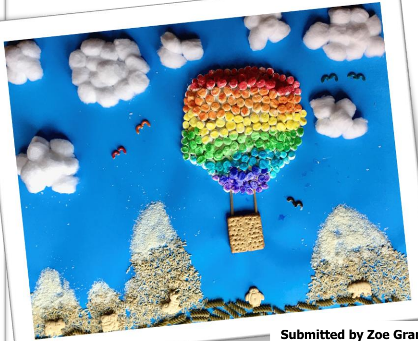
Submitted by Zoe Grant