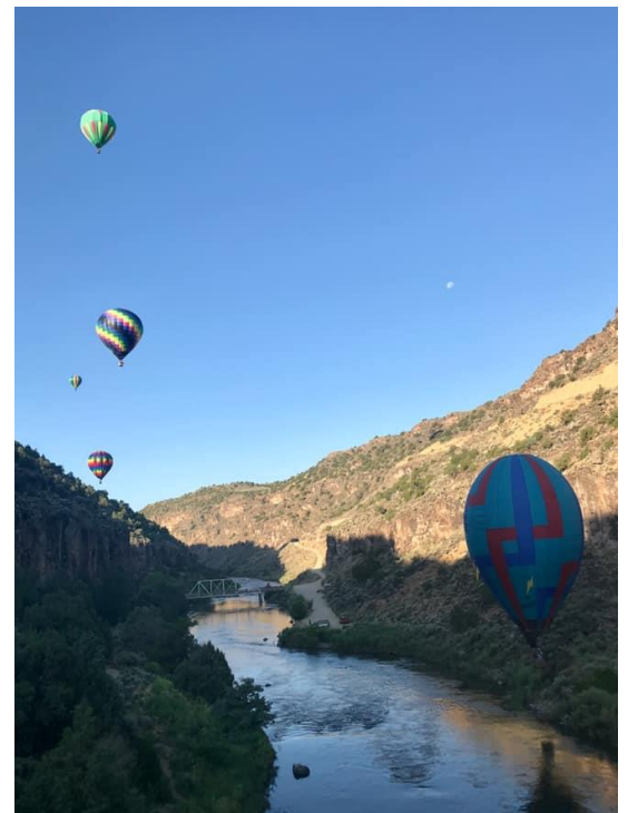
Rio Grande Gorge, Taos, New Mexico