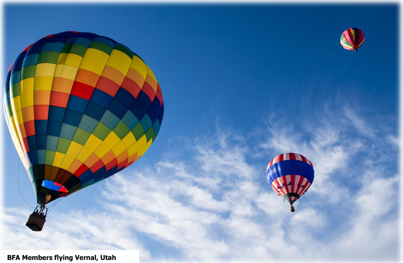
BFA Members flying Vernal, Utah

FULL! Rio Grande Camp-Albuquerque, New Mexico July 13th - 18th, 2019 FULL!