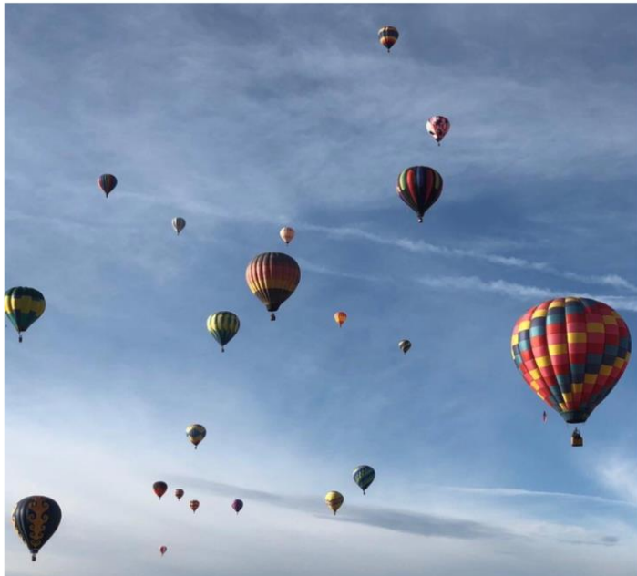
Friends & Lovers Balloon Rally, Sunday Feb. 10, 2019

Online registration is now OPEN! If you cannot make it to an in-person seminar this year the Online Seminar will be available for viewing starting Saturday, April 27, 2019. Register here: https://www.bfa.net/index.php?option=com_rsform&view=rsform&formId=50&fbclid=IwAR0LZ0xXa-eL70I_dM6l6iokYHqgmK-IYTnWHw790jDGVYr7cmkMt6O60Cg