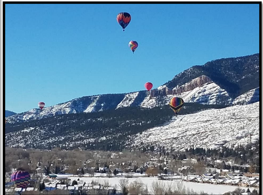
Durango, CO Snowdown Winter Festival Feb. 2, 2019