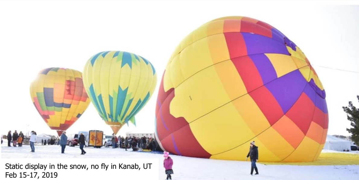
Static display in the snow, no fly in Kanab, UT Feb 15-17, 2019