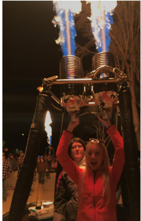
Even the "big kids" get excited! Kanab, UT Feb. 16, 2019