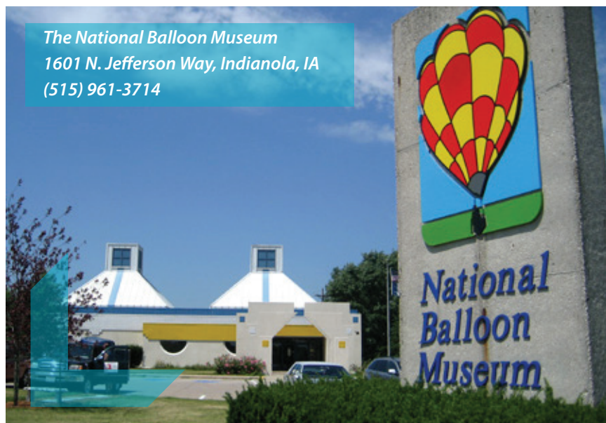
The National Balloon Museum 1601 N. Jefferson Way, Indianola, IA (515) 961-3714