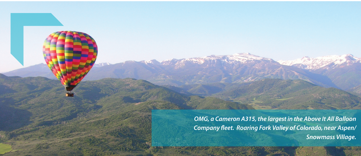
OMG, a Cameron A315, the largest in the Above It All Balloon Company fleet. Roaring Fork Valley of Colorado, near Aspen/ Snowmass Village.