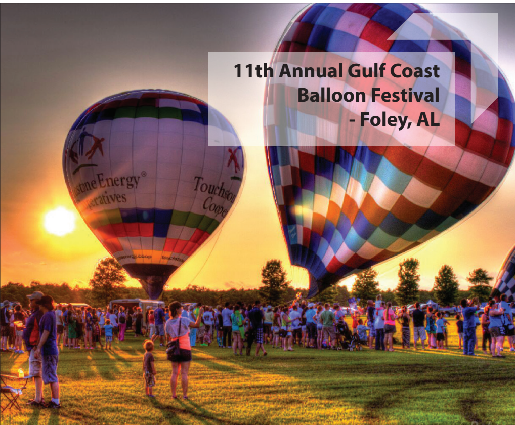
11th Annual Gulf Coast Balloon Festival - Foley, AL