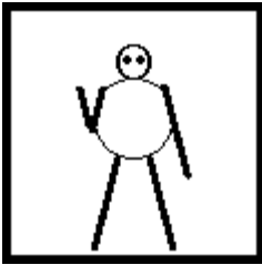
Stay on ground; follow instruction of my right hand.