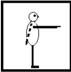
I acknowledge your white flag.