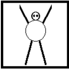
Clear for take-off