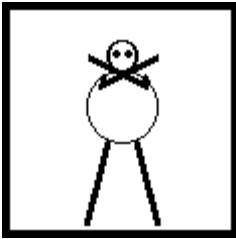
Cancel all previous instructions. Wait.

9.15.4 This permission does not relieve the competitor of complete responsibility for his take-off, including adequate lift to clear obstacles and other balloons, and to continue safely in flight. A competitor taking off without permission, whether due to loss of control or any other reason, may be penalized up to 500 competition points